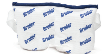
Item 34180 Bruder Moist Heat Sinus Compress