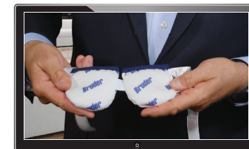
Bruder Moist Heat Eye Compress. A Key Component for the Treatment of Dry Eye

Patient and staff education helps people make better informed decisions about their eye care. In support, Bruder offers an on-line learning library featuring videos about products and conditions.