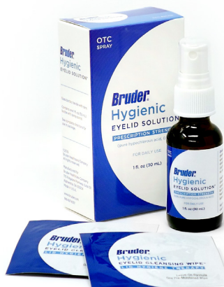
Item 78000 Contain 30 Wipes and 1 fl. oz. Solution