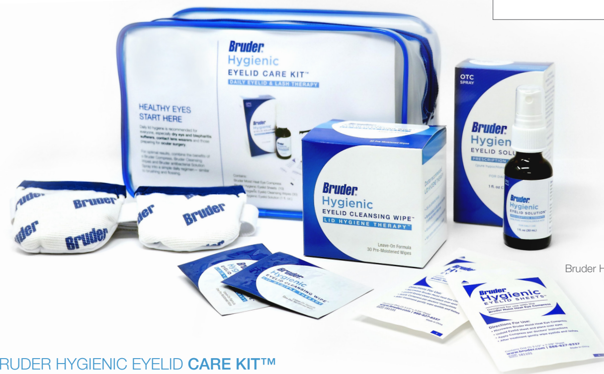
Item 79340 Bruder Hygienic Eyelid Care Kit