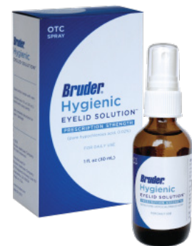
Item 46201 1 fl. oz. - 1 fl. oz. and Item 46202 - 2 fl. oz.

The gentle no-rinse, leave-on formula wipes contain no tea tree oil or other ingredients that sting or burn, making them perfect for daily use.