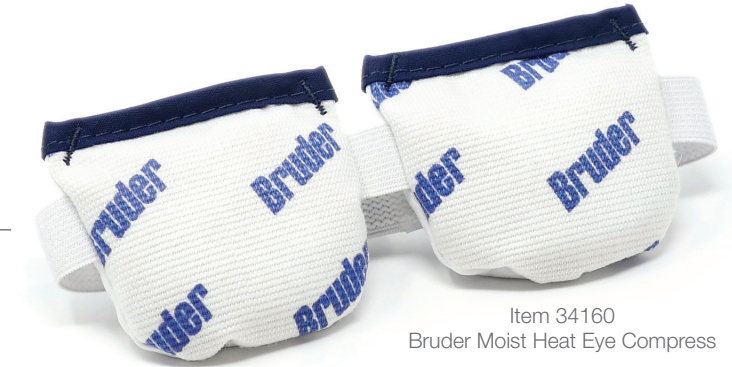
Item 34160 Bruder Moist Heat Eye Compress

SCAN OR CLICK LEARN HOW BRUDER CAN HELP YOUR PATIENTS