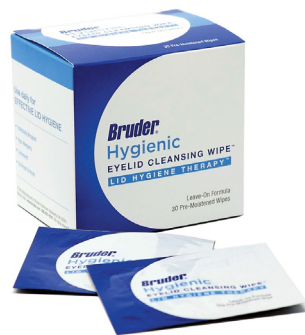
Item 78800 Pre-moistened lid hygiene therapy wipes

Eyelid hygiene is important — whether or not a patient already has symptoms. A daily lid cleansing routine that begins with Bruder Hygienic Eyelid Cleansing Wipes and Solution is a simple way to promote wellness and relieve uncomfortable symptoms. Good lid hygiene is also important to surgical outcomes.