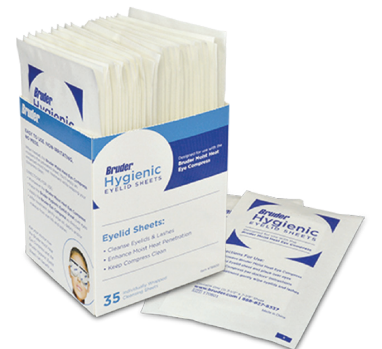
Item 78900 35 Individually wrapped sheets per box