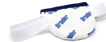
Item 34170 Bruder Moist Heat Eye Compress Single